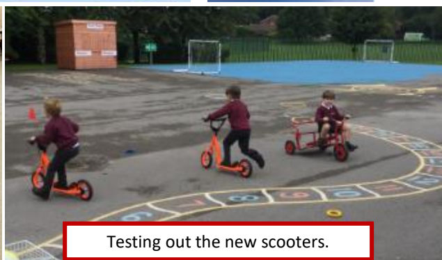
Testing out the new scooters.